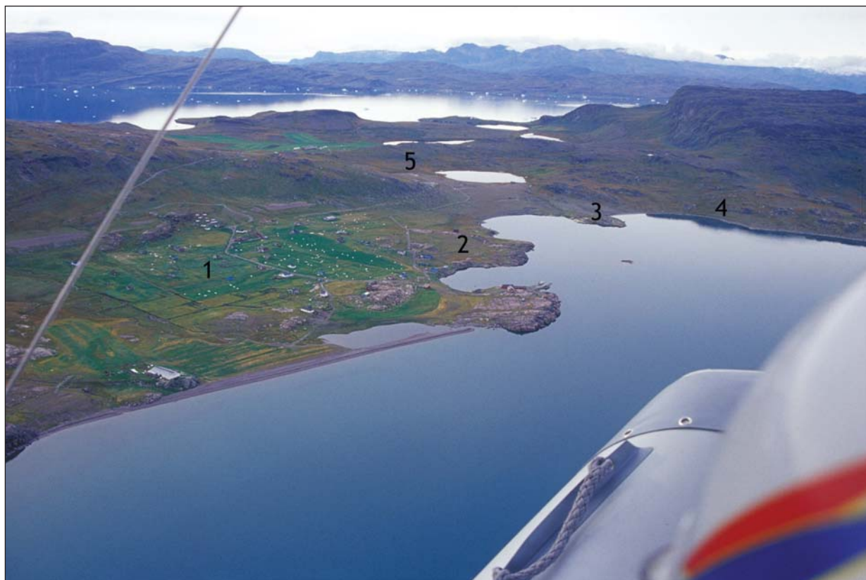
Figure 5. Overview of Garðar and Einarsfjörður. 1. Garðar. 2. Garðar þing. 3. The point referred to in the Fóstbræðra saga as leiti (higher ground). 4. The suggested booths for visitors. 5. Eiði. From Gulløv (2008:102).

Turning back to the site originally suggested by Clemmensen, there are several other interesting features. The first is a fireplace, 70 cm long, which was found ca. 100 m east of booth 27 (Clemmensen 1911:338, Nørlund 1929:127), and there may well be other such features here. 22 The Brattahlíð hearths were found as a result of the deturfing of a large area for excavation after features had been discerned on