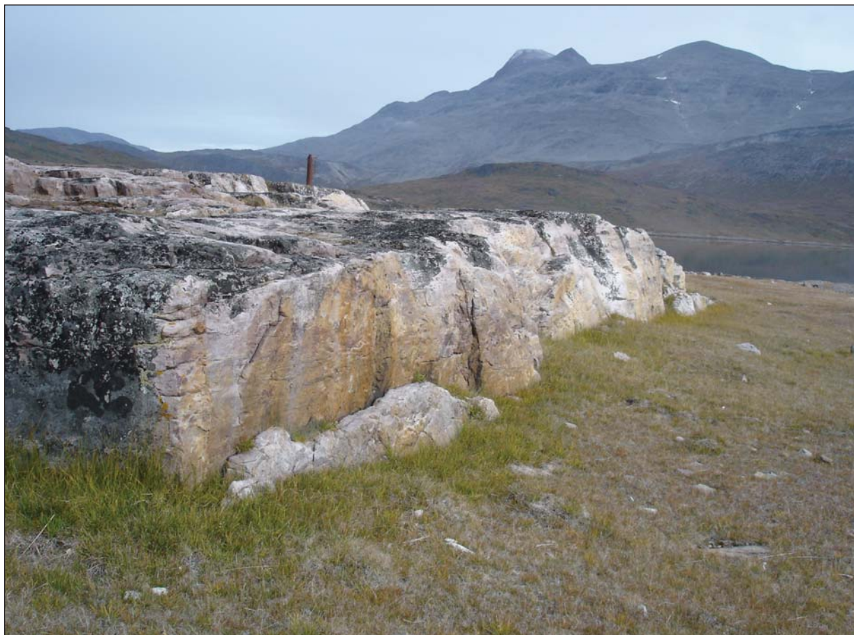
Figure 6. The possible “law rock” at Garðar, seen from the east.

The striking similarities between the two sites at Brattahlíð and Garðar, both in terms of archaeological features and landscape characteristics, strongly suggest that they were indeed Greenlandic assemblies. The absence of written evidence of thing meetings at Brattahlíð does not mean that this site should be dismissed, as we are dealing with an area and a time period for which written evidence is extremely sparse. Another issue which goes against the identification of Brattahlíð as an assembly is that the lawmen seem to have lived here. Proximity between the lawman’s farm and assemblies has not been observed anywhere else and could indeed suggest that Brattahlíð was not an assembly. It is, however, important to point out that both these Greenlandic booth sites were located close to high-status farms. The reason for this may be the structure of society, as Norse Greenlandic society, in contrast to that of the Viking homelands, appears to have been a “two-tier society”. In Greenland, there were a few powerful