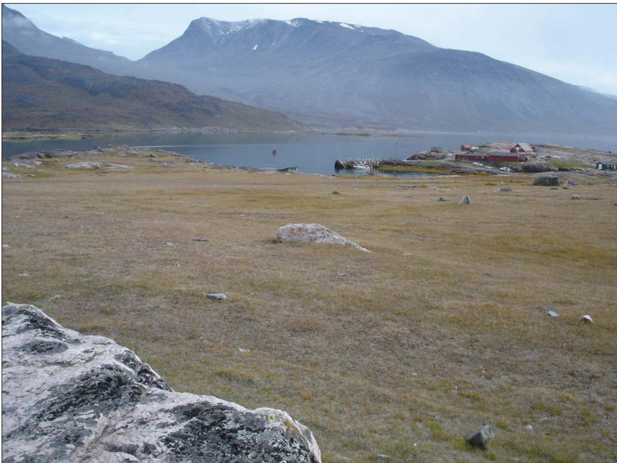
Figure 7. View of the harbor from the possible “law rock” at Garðar.

By analogy with Scandinavia, the ideas of competing or successive sites seem the most plausible. It would be unlikely to have two sites that were so close together, and so similar, for different types of meetings. The creation of thing sites must be seen as a sign of a chieftain taking control, or attempting to take control, of the judicial system in the area. An added attraction for chieftains was that they could presumably take a portion of the fines, in the same