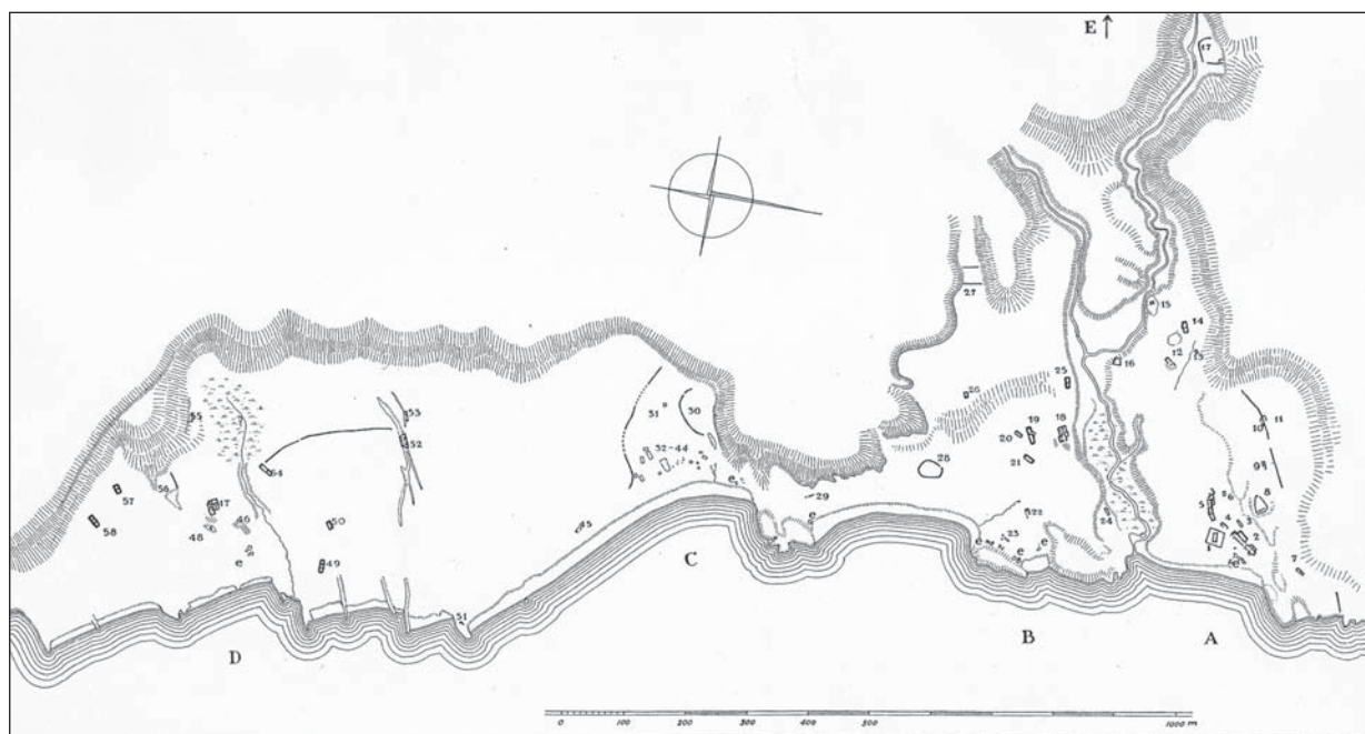
Figure 1. Site plan of Brattahlíð with the assembly site. From Nørlund and Stenberger 1934: Plate 1.

In 1932, ruin group Ø28A was investigated, less than one km from the dwelling houses of farms Ø28 and Ø29. At the site, 13 booths were recorded (ruins 31–36 and 38–44), of which some were excavated. It was these finds that first led scholars to suggest that an assembly site had been identified. The booths were built directly on the shingle, with low turf walls on light stone foundations, over which tents were