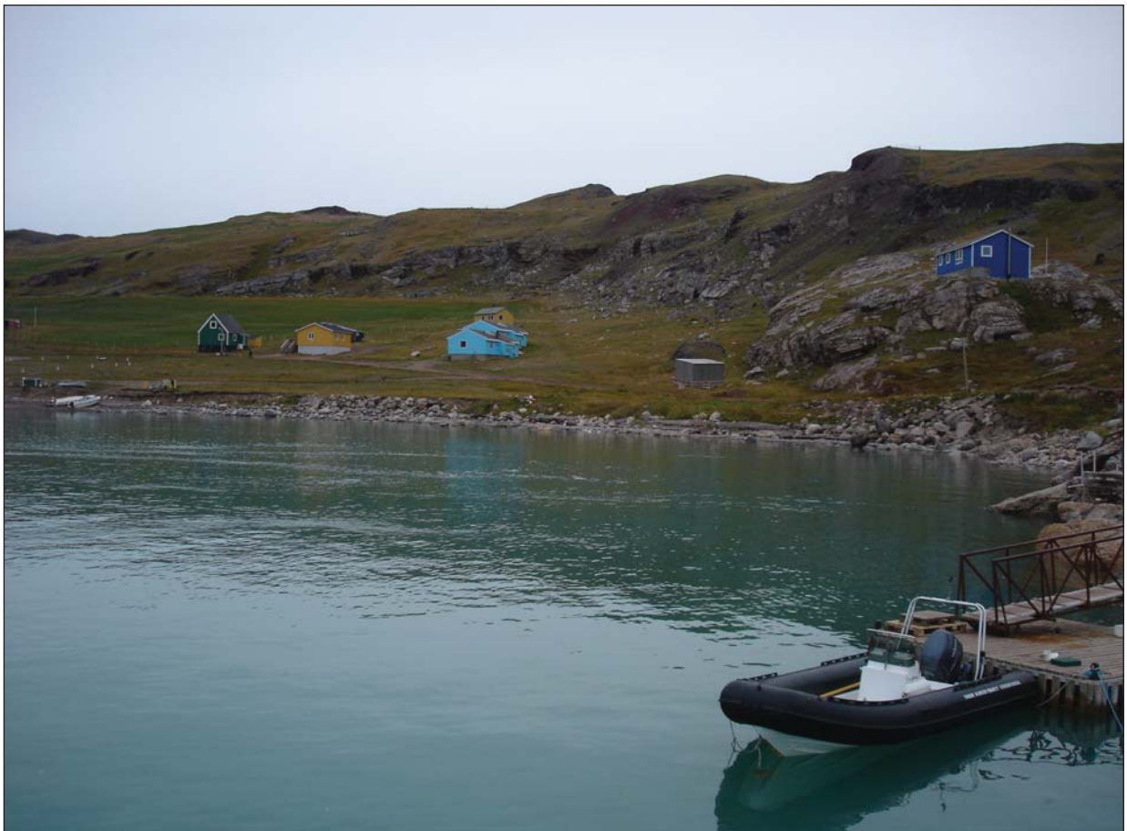
Figure 3. View from the harbor of Brattahlíð thing site.

For Garðar, the written evidence is stronger, as both Fóstbræðra saga and Grænlinga þáttur state that thing meetings were held here (Krogh 1967:167, Røkke 1933:89–103, Seaver 1996:62, Sveinsson and Þórðarson 1935:273, Þórólfsson and Jónsson 1943:229). The Garðar site as a whole consisted of the bishop’s farm (Ø47) with a large number of ancillary structures, including the cathedral and churchyard.